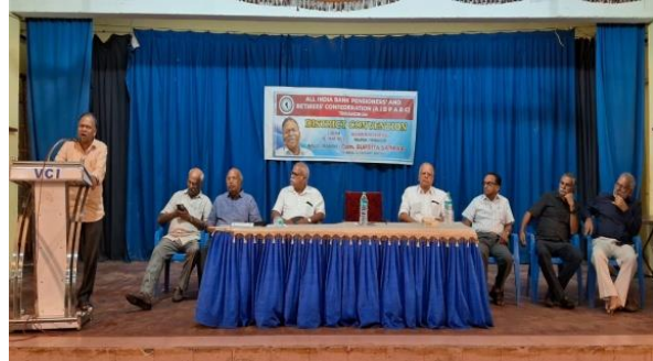
A view of the dais