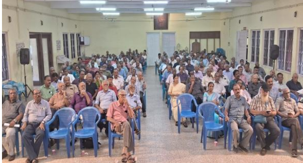
A view of the audience