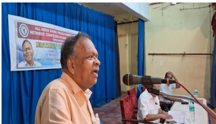
A view of the dais.