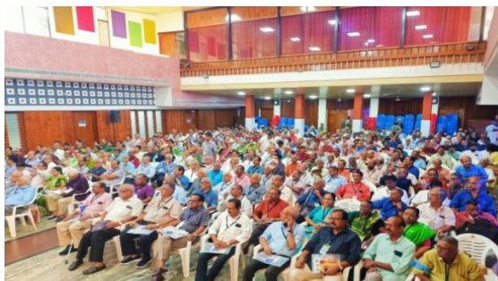
A section of the audience.

1. The 9 th National Conference of ABROA unit SBT coinciding with the Silver Jubilee celebration will remain a milestone event judged by the standard of massive participation and the prevailing mood of festivity. The hall was packed to the capacity even at 9:30 am. 750 members gathering from different parts of the country occupied the seats and a few hundred had still been moving outside the hall. The enthusiasm of meeting the old colleagues had an emotional touch.