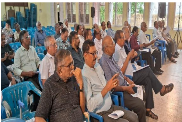
A section of audience at the meeting of the State Committee.

It was an hour-long session which had its novelty and uniqueness. Not less than 17 members asked pointed questions on different issues affecting the interest of the Retirees and the organization. The General Secretary to the best possible ability answered all the queries with clarity. The meeting ended with satisfaction. We give hereunder two photographs.